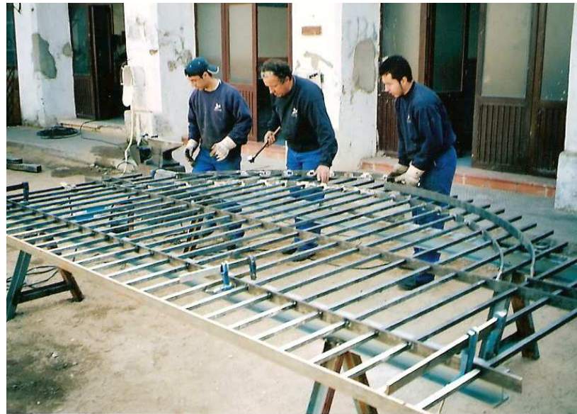
SCHOOLS Factory. London 15-19 September 06

Training character of initiation, the students will have right to perceive a study scholarship.