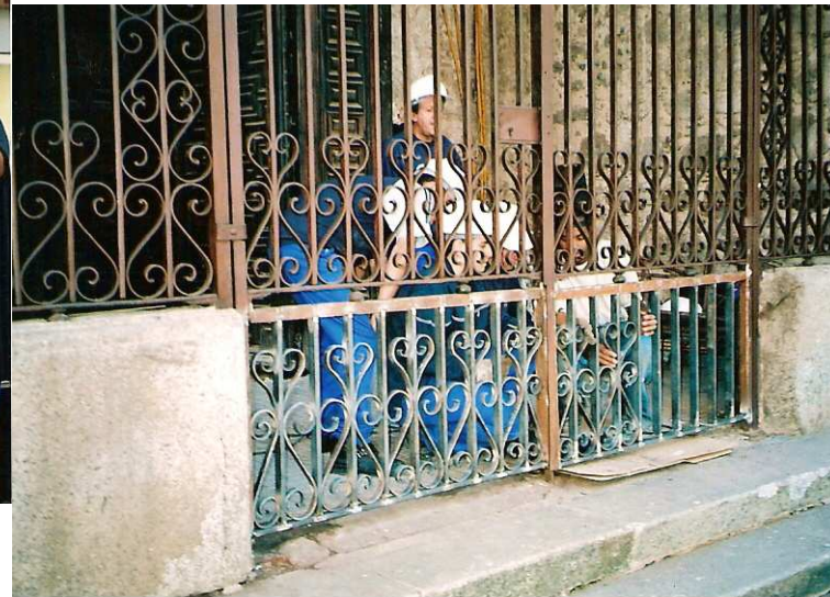
Schools Factory. London 13-15 September 06